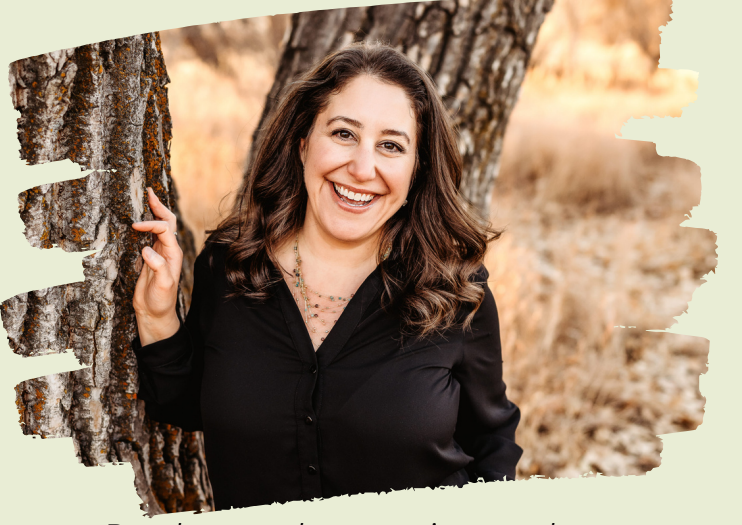
Read more about my journey here